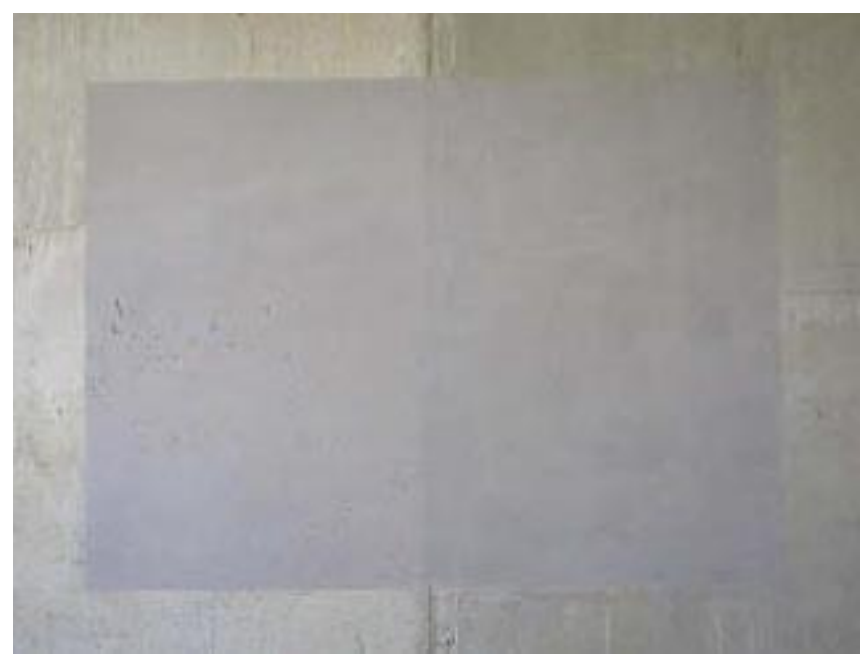
Concretal Lasur unifies repairs whilst maintaining look and feel of concrete