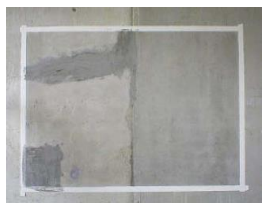
Typical on site repairs and variations