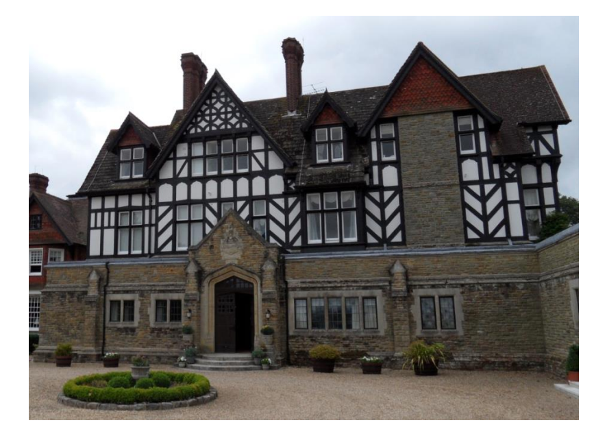
Roffey Park, Colgate, West Sussex, Grade II Listed

Conventional acrylic paints merely coat the surface and create a film around the substrate. This film forming coating does not allow moisture vapour to pass through it, which can result in the formation of blisters which may lead to cracking and flaking paint finishes. lf moisture vapour is unable to pass through the surface, this can lead to elevated moisture levels within the substrate eventually leading to friability and damage. This is a common problem in older buildings, in particular where a variety of coatings are likely to have been applied over the years.