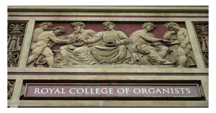
Above: Stone details during and after restoration with the KEIM Restauro Stone Repair System

Left: Royal College of Organists, London – Grade II Listed