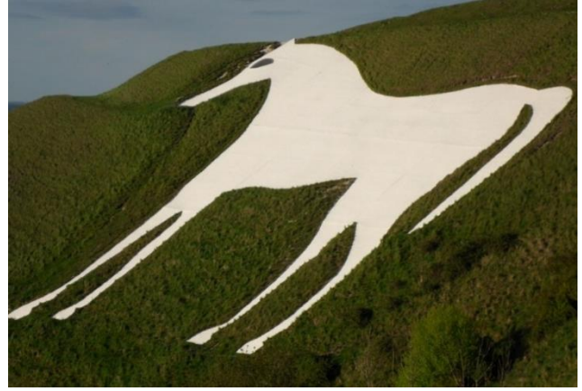
Left: Before and during restoration, Above: After redecoration