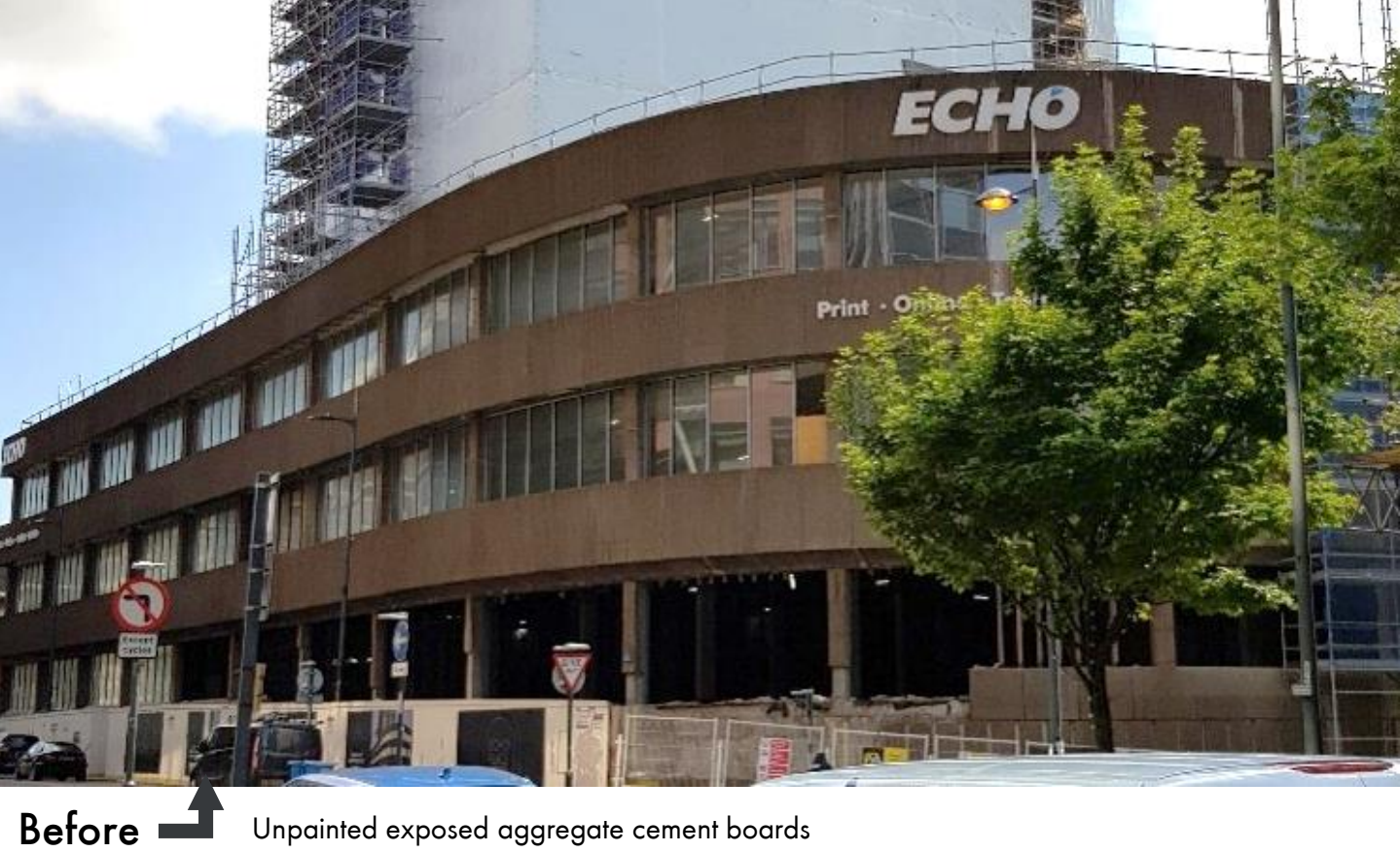
Unpainted exposed aggregate cement boards