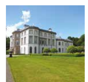
KEIM NHL Kalkputz