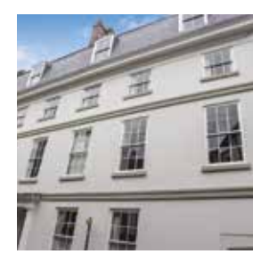
KEIM Universal Render