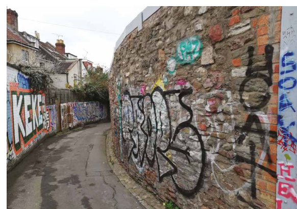
Anti-Graffiti Finishes: KEIM MX Glaze KEIM Wax Coating