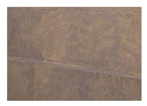
Colourwash Finishes: KEIM Lasur Range