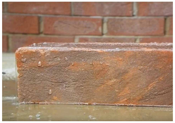
Water Repellent Finishes: KEIM Lotexan/N KEIM Ecotec KEIM Silan 100

KEIM's special products are all developed using the same philosophy as our mineral paint systems, to ensure substrate breathability, durability and longevity.