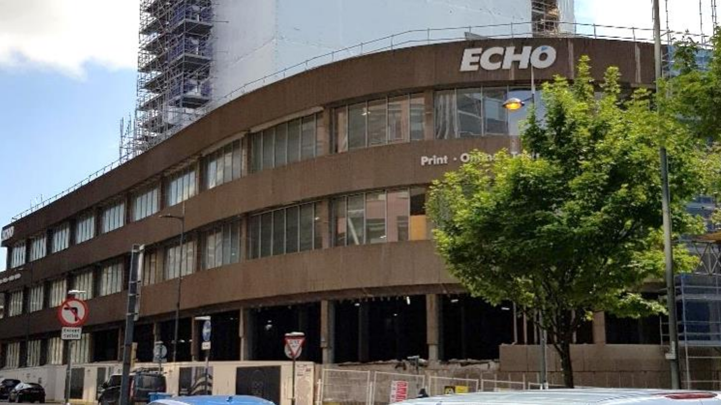
Before ↗ Unpainted exposed aggregate cement boards